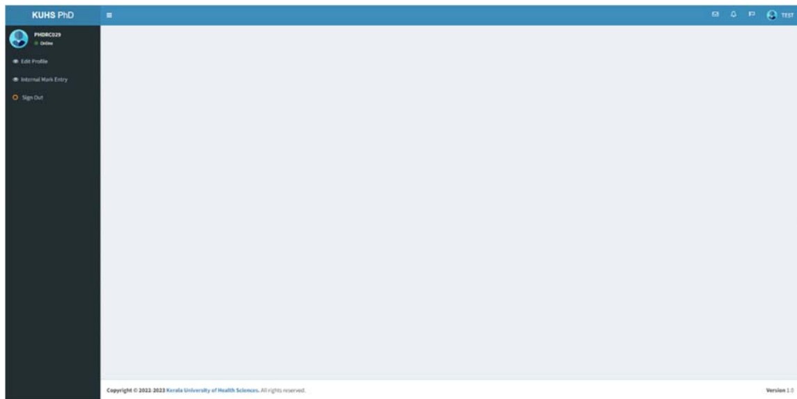
Fig. Research Center Home Page