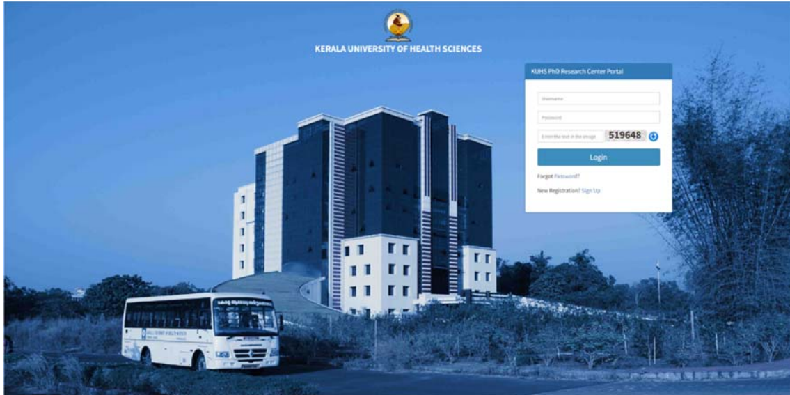
Fig. Research Center Login Page

Step 1- Login to KUHS Research Center Portal using Username and Password