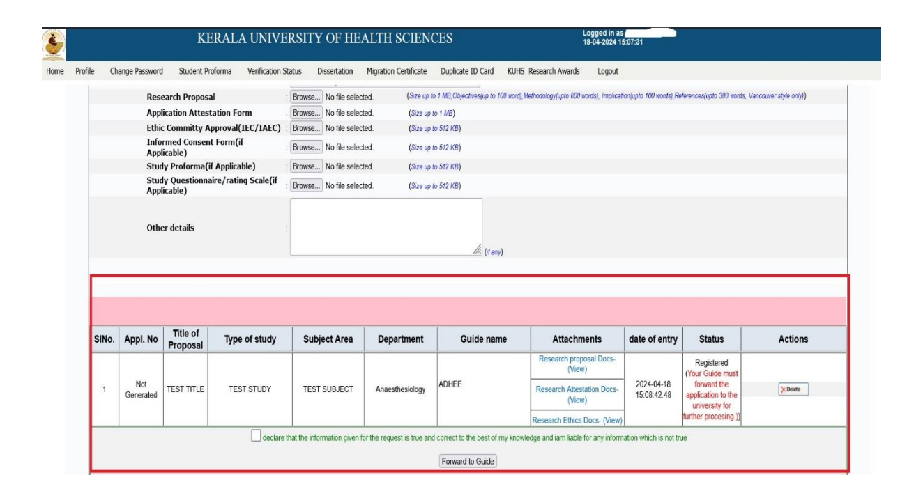
Step 3 - Forward the Application to Guide