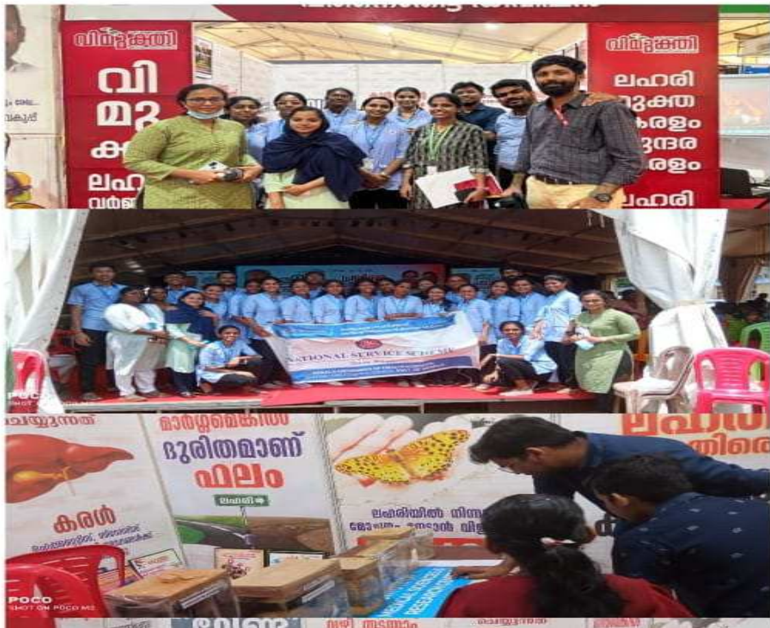
NSS Volunteers in collaboration with Excise Dept, Vimukthi at Pathanamthitta