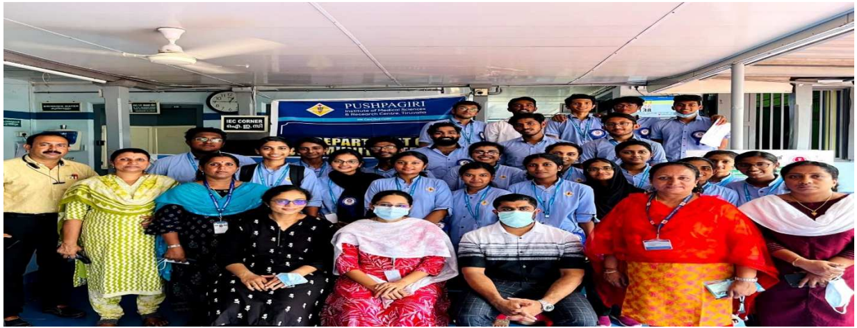
NSS Vounteers observed World Malaria Day in collaboration with Community Medicine Dept and FHC Othara